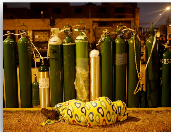
Peru, February 2021

While liquid oxygen industry leaders acknowledged the significant capital infrastructure required and long lead times (two to five years) to establish new air separation units (ASUs) in LMICs, they also stated that where the infrastructure exists it is relatively easy to generate additional oxygen supply. What is challenging is getting that supply to LMIC hospitals and ensuring that they are equipped to store and pipe it to bedside or to fill cylinders safely, as liquid oxygen is highly flammable. Typically an existing ASU can serve hospitals within a 300km/190mile radius and if hospitals have the financing, the infrastructure, and the staff to secure and manage a liquid oxygen supply they should not experience shortages, even during a pandemic. Negotiating supply with hospitals in the geographic footprint of liquid oxygen plants is “very feasible” and the focus should be to keep contracts, “simple and safe.”