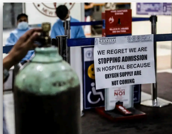
India, April 2021

Agencies appreciated the need to sustain new investments in oxygen beyond the pandemic and acknowledged that this will also help to reduce deaths from many other causes including infectious diseases (e.g., pneumonia, malaria, tuberculosis) and chronic diseases (e.g., COPD), and improve outcomes for patients needing surgery. Greater access to oxygen will also benefit patients across the life course, from newborns in respiratory distress to elderly patients with chronic respiratory conditions. In this way, investments in oxygen will help LMICs achieve most of the Sustainable Development Goals (SDGs). This preferred approach was summed up by a taskforce member as, “saving lives in the short term and building the infrastructure to strengthen health systems over the long term.” Several taskforce members described their commitment to oxygen as long-term with one stating a capacity to “channel significantly more funding to oxygen.”