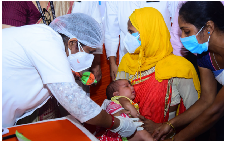
Photo: PCV introduction in India, JSI, 2021

Share: #Vaccines4Life #EveryBreathCounts